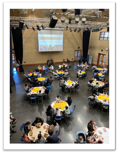
Image from our Parent Partnership event

All of these results combined meant the Girls team finished in 4 th place, the boys team finished in 2 nd place and overall the Academy finished 2 nd in the District. An incredible result for all of the students involved.