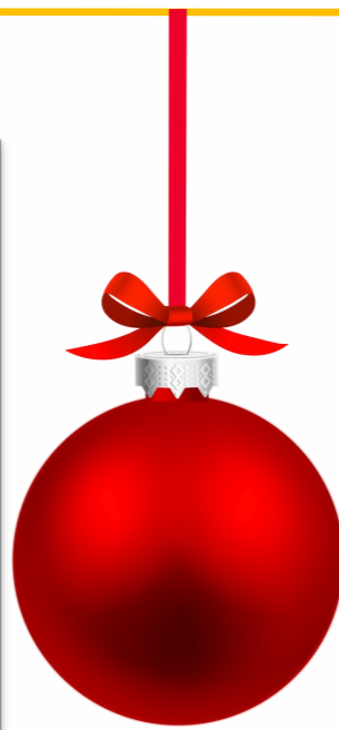
More fun in the snow on Page 2