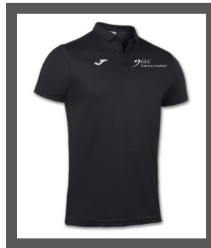
GA Sports polo £15.00