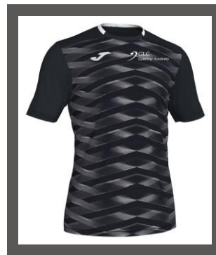
GA Rugby Top £17