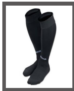
GA Football socks £4.13

Alternative tracksuit brands will not be allowed, all items should have The Gateway Academy logo on them, or alternatively be plain black (no branding). The PE kit can be purchased directly from: https://www.kitlocker.com/thegatewayacademy/