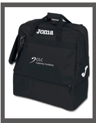
GA Sports Bag £16.13