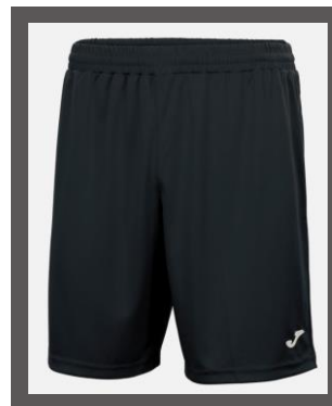
GA Boys Shorts £5.14