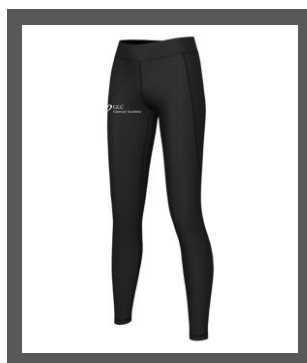
GA Sports Leggings £21.00

PLEASE NOTE THAT SHORTS SHOULD BE OF AN APPROPRIATE LENGTH SUITABLE FOR OUR ACADEMY ENVIRONMENT.