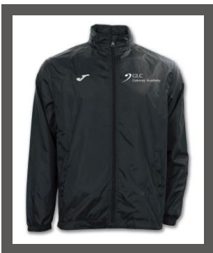
GA Rain Jacket £14.89