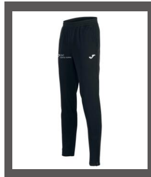
GA Tracksuit Bottoms £18.56