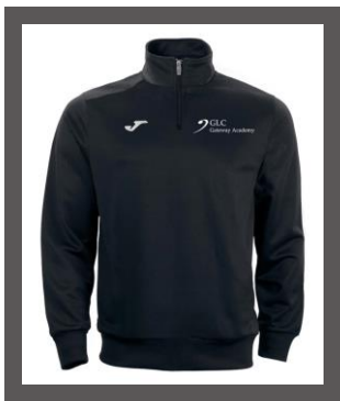
GA 1/4 Zip Jumper £16.88

Below are the acceptable sportswear which can be worn in PE and Dance lessons, however, as an alternative, students can wear plain black (no branding whatsoever) PE and Dance kits.