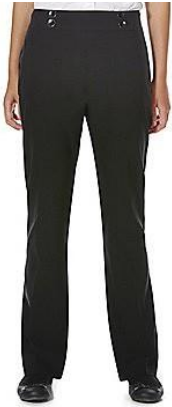
Regular Leg Trousers