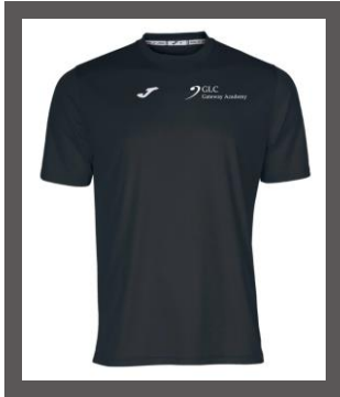
GA Sports Top £9.00

Below are the acceptable sportswear which can be worn in PE and Dance lessons, however, as an alternative, students can wear plain black (no branding whatsoever) PE and Dance kits.